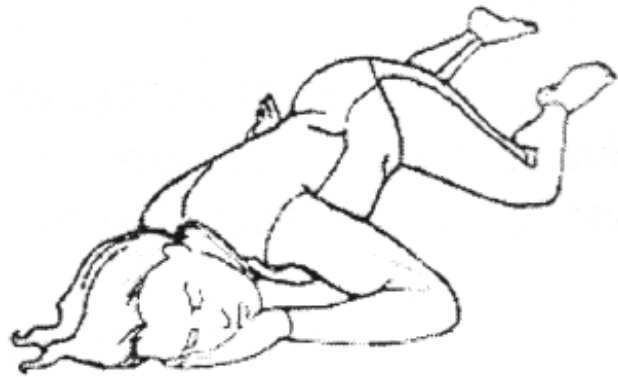
More Stable Position (For use on Boats)